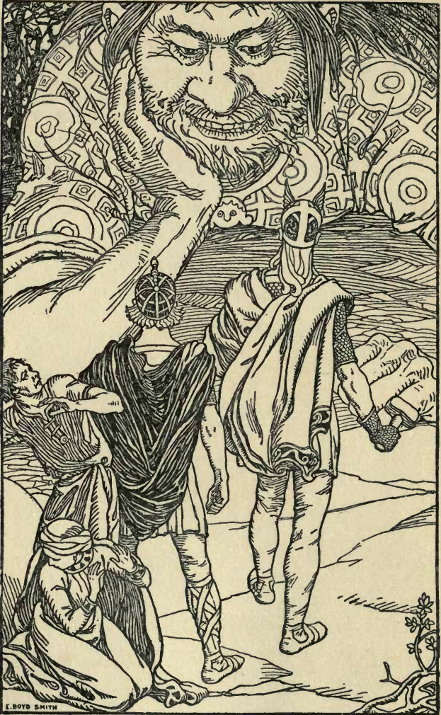
"I AM THE GIANT SKRYMIR" (page 150)