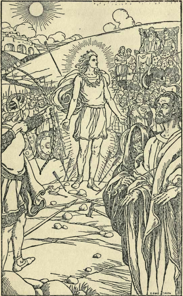
EACH ARROW OVERSHOT HIS HEAD